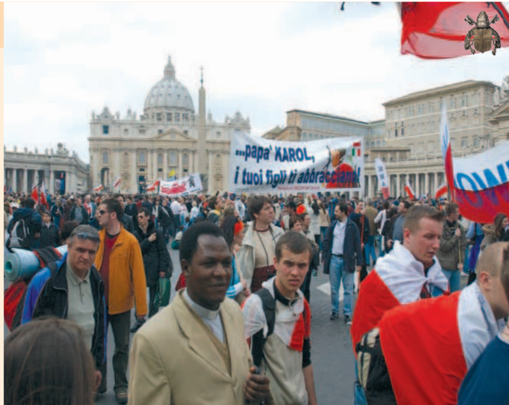
After John Paul II's funeral Mass

Jesus Christ is the way, the truth and the life (Jn 14: 6). We must encounter Him and love Him. The best way to do