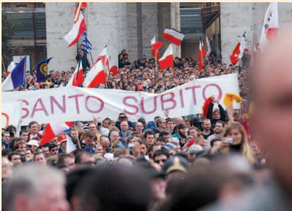
for. Archivum MSI